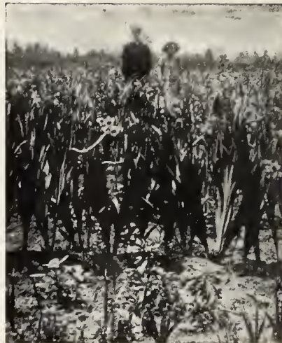
Our Field of Gladioli

RAINBOW MIXED. 75 first size, $1.00; 100 second size for $1.00 STANDARD VARIETIES. 50c a dozen, unless other- wise stated.